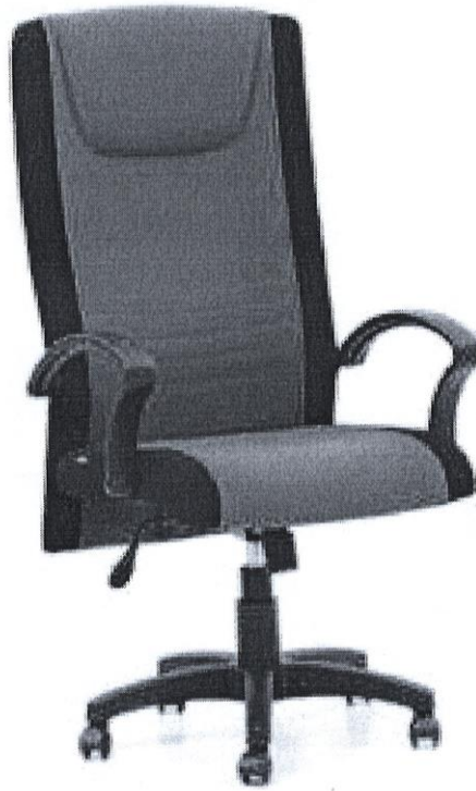
OCH 002 High Back Chair