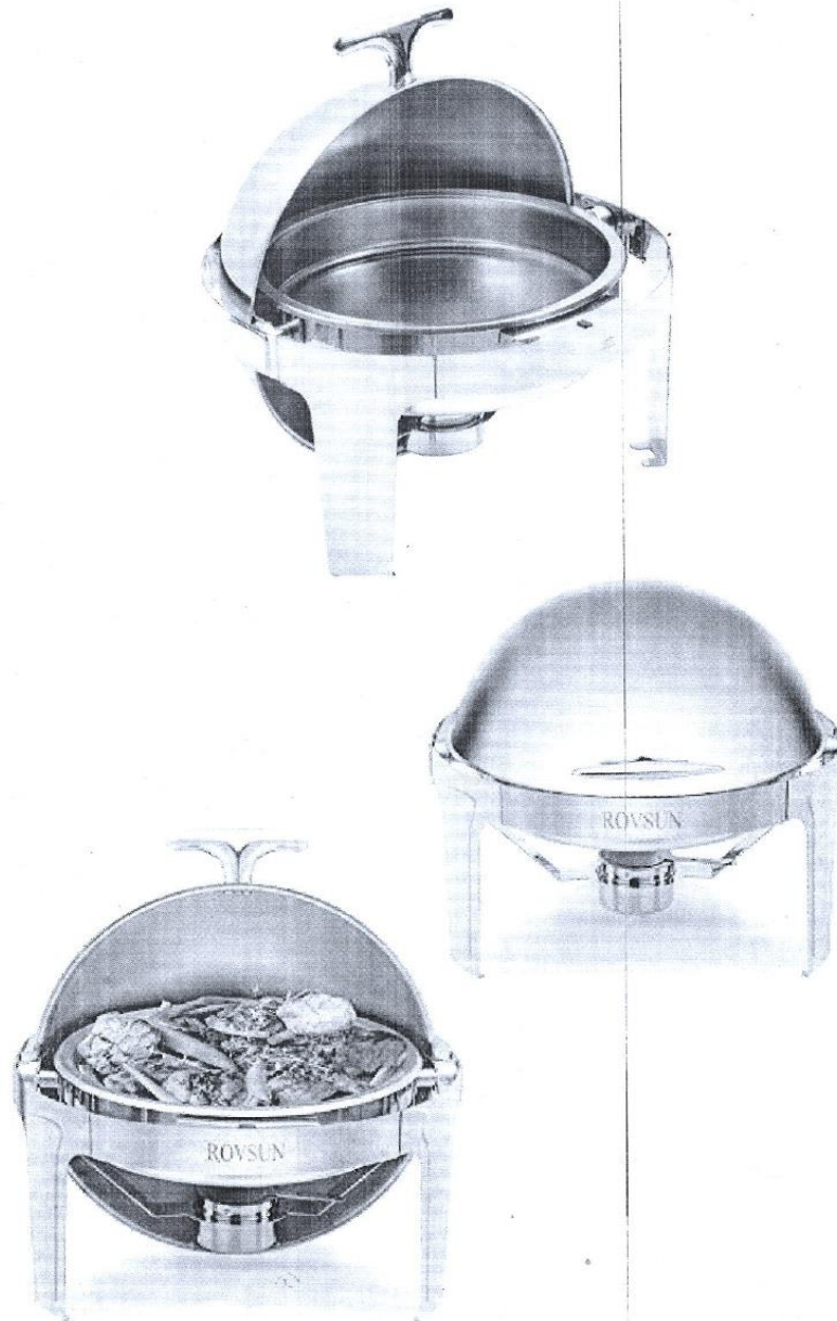
9 Liter Buffet Set (Round Shaped)